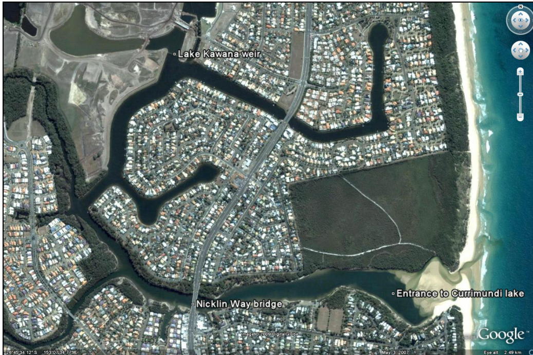
Figure 1. Location of Currimundi Lake

Prior to the 1950s, Currimundi was in a relatively natural state by all accounts, and would have on average been semi-closed with a low flow tidal channel connecting the lake to the ocean through a wide sand berm. Under these circumstances, the water level would be stable and vegetation and aquatic fauna would have been established to suit these conditions. The occasional breakthrough and flushing of the lake would have disrupted these conditions for a short time, but the semi-closed state would have re-established rapidly.