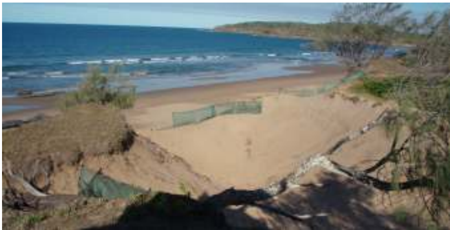
Figure 5. Sand blow area.

In this approach a combination of regulation by the State, local government assistance and community partnerships has assisted in resolving an environmental problem with the common goal of improved dune management. As a result Miriam Vale Shire Council has committed to development of a shoreline erosion management plan to better maintain the coastal dune and plan the location of future beach access, facilities and pathways.