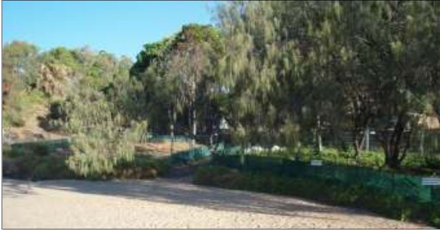
Figure 2. Revegetation area.

In this instance a regulatory approach was taken and the outcome of protecting the dunes was obtained.