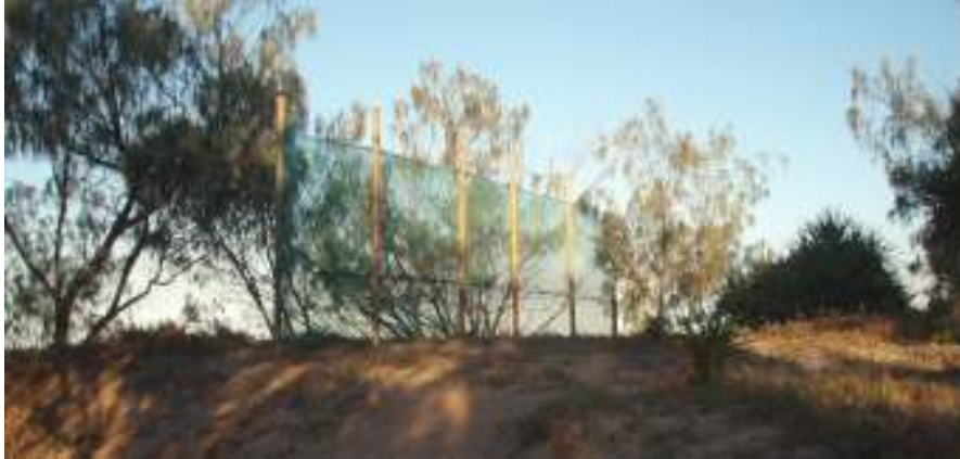
Figure 3. Wind screen.

As a result of this event, there has been an increased awareness regarding the importance of coastal dune vegetation and activities that are prohibited in reserve land. Miriam Vale Shire Council has also started development of a local law which will provide greater protection and enforcement at a local level for vegetation on reserve and esplanade lands.