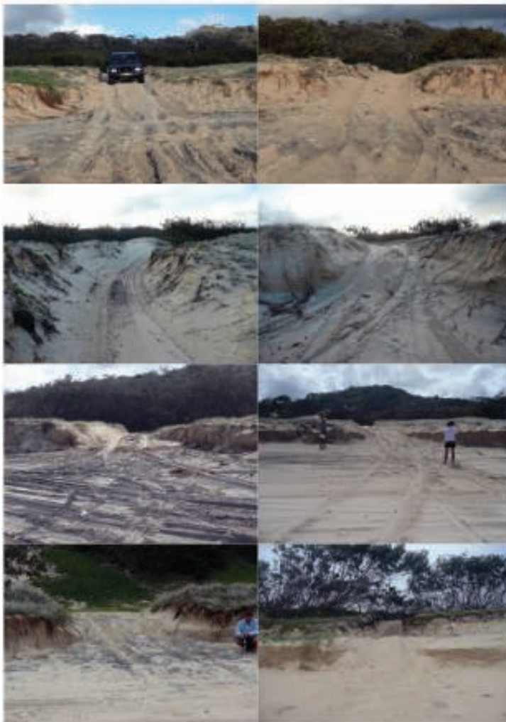
Fig. 1 Examples of damage to dune fronts on Fraser Island caused by vehicle tracks cut through the frontal dunes to access camp grounds located in the mature dunes further inland.

As currently practiced in southern Queensland, campsites in coastal dunes can usually only be reached via vehicle tracks cut directly from the beach through the foredunes, causing physical habitat changes. Possible ecological impacts would be manifested as reduced vegetation cover, lower plant species richness and decreased habitat quality for the dune fauna. Yet, neither the extent and distribution of such physical dune damage nor any of the putative ecological impacts have been quantified in the region; consequently, this is the primary objective of this study where we use Fraser Island as test region to assess these changes.