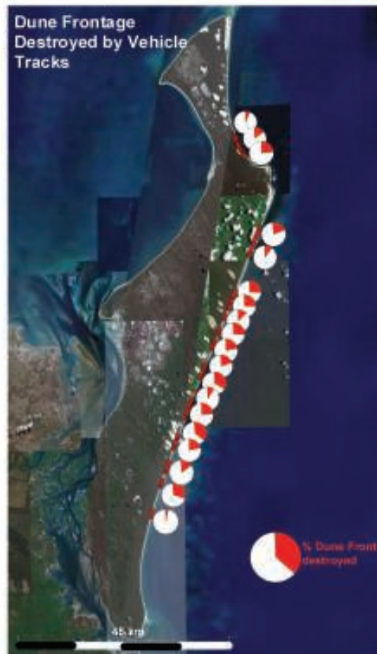
Fig. 2 Physical damage to foredune fronts caused by vehicle tracks cut from the beach across the dunes to access camping zones further inland on Fraser Island.

Physical habitat disturbance by vehicle tracks significantly reduces the density of ghost crabs in the foredunes. Fewer ghost crab burrows occurred in vehicle tracks at the height of the second dune crest compared with the adjacent dunes (ANOVA, Effect: Crest x Impact