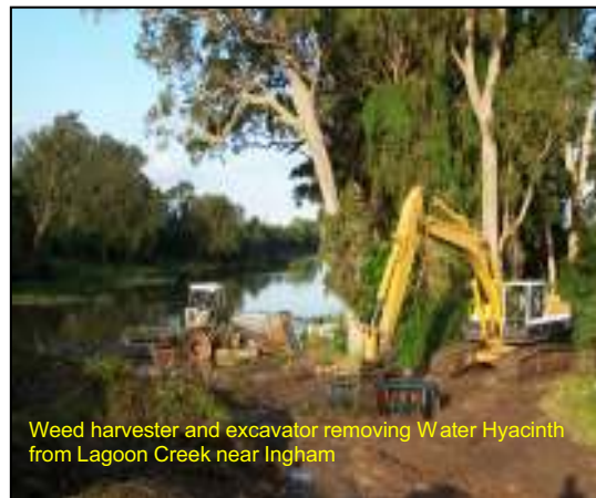
Weed harvester and excavator removing Water Hyacinth from Lagoon Creek near Ingham

The Lagoon Creek multi-faceted approach has achieved a dramatic improvement in water quality.