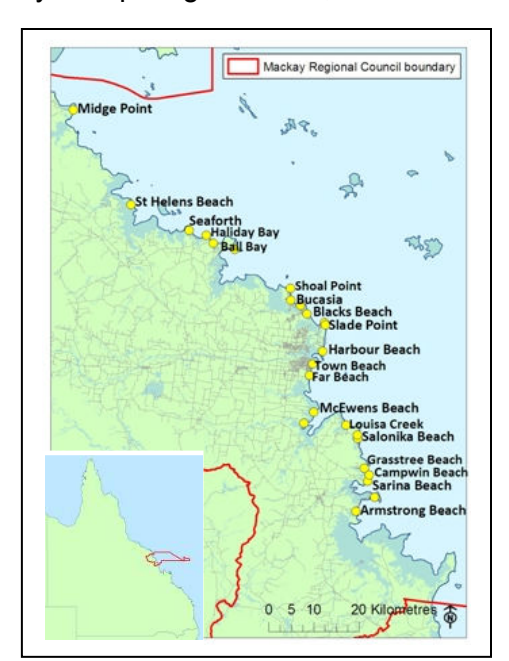
Figure 1: Mackay Regional Council mainland coastline and key residential beaches.

The Mackay Regional Council jurisdiction is one of the fastest growing in Queensland, with an average annual growth rate of 3.3 per cent, compared with 2.6 per cent for the state (The State of Queensland, 2010). The majority of the population in the Mackay region lives on or directly adjacent to the coast, and subsequently the resources in this landscape are highly sought after by competing interests; residential development, tourism, commercial and recreational uses.