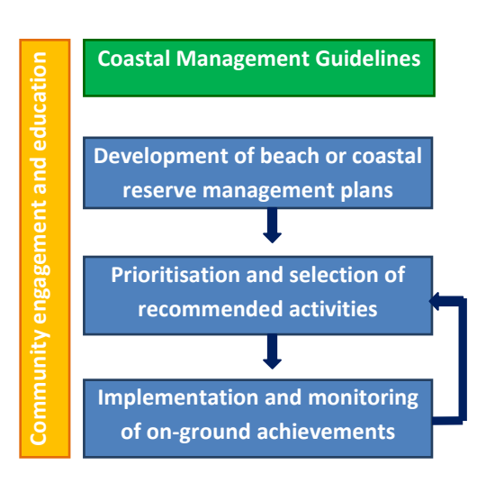
Figure 2: Coasts and communities program model

Queensland Coastal Conference 2011 Wednesday 19 – Friday 21 October 2011