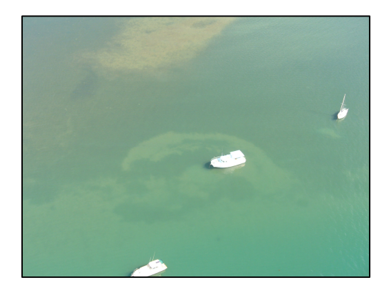
Plate 1. Disturbance halo of traditional block and tackle mooring on seagrass habitats in Moreton Bay.

Mooring chains of 'traditional' block and tackle buoy moorings drag on the substrate around their moorings, resulting in significant scouring of sediments and disturbance to seagrass and other benthic marine plants. The amount of disturbance can be more than 0.1 ha per vessel, in the shape of a halo. Given the large number of moorings currently present and predicted demand for new moorings, this represents a significant area of seagrass and other benthic habitats being disturbed in Queensland.